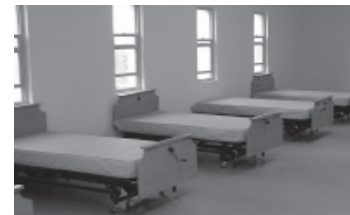
Special Needs Dorm

The 910 West Holly Street Mission building houses the Men's Shelter, Extended Guest Shelter, Cold Weather Shelter, Special Needs Dorm, Respite Care for Men, the chapel, and the kitchen where hot meals are served daily. Case managers help our guests break free from their lives of homelessness by addressing the root causes of their homelessness. There are no fees for our services.